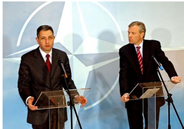
Georgian PM Zurab Noghaideli with NATO Secretary General Jaap De Hoop Scheffer

The upshot appears to have been to delay – that is, to remove any sense of automaticity – but not to derail ID for Georgia. That point made, a consensus is now forming to proceed soon to ID with Georgia. A similar phenomenon will no doubt surface when the time comes for Georgia to move