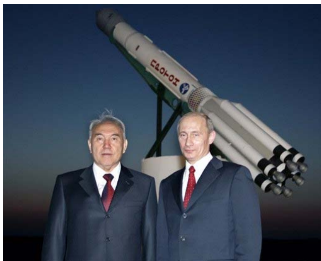
Two presidents at the launching

Kazakhstan's cooperation with the Russian Roskosmos space agency proved to be more fruitful. The Kazakh government first announced its plans to construct its own commercial telecommunications satellite in 2004, but lacking the adequate technology to construct it, the government had to place an order with Russia's Khrunichev space technology center, while some French space technology companies offered technical assistance in the construction of the satellite.